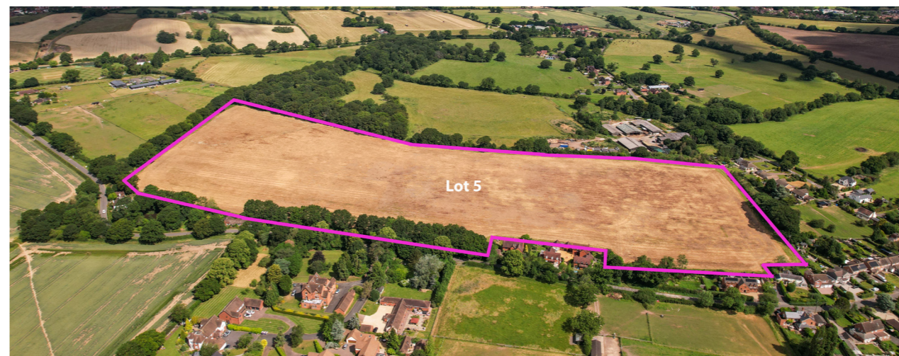
LOT 5 – (PURPLE) Woods Field Land off Sambourne Lane 11.609 ha / 28.69 acres Crop type – Arable i) What3Words: ///caves.retail.risky ii) What3Words: ///send.using.civil