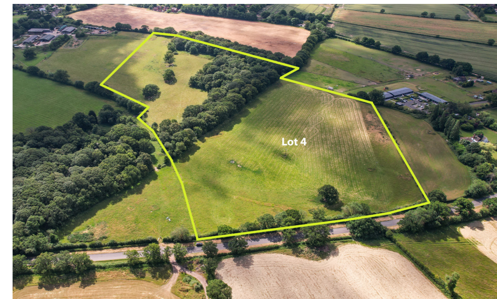
LOT 4 – (YELLOW) Westwoods & Sling (+part Big Reins) Land to the South of Jill Lane 11.045 ha / 27.29 acres Crop type – Part arable, part woodland, part permanent grass What3Words: ///flats.family.looked