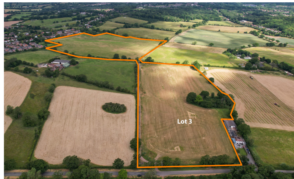
LOT 3 – (ORANGE) Perkins & Yeomans Land to the North of Jill Lane (Access also from A441 Evesham Road) 15.211 ha / 37.59 acres Crop type – Arable i) What3Words: ///lease.images.discouraged ii) What3Words: ///books.rods.handed