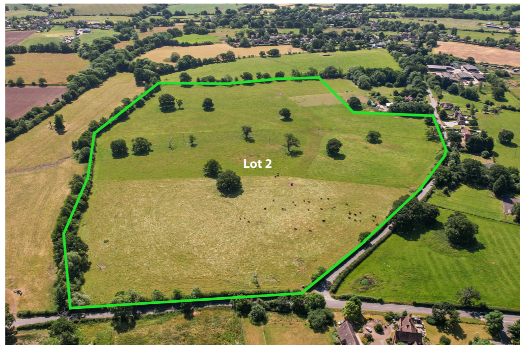
LOT 2 – (GREEN) Oak Tree Field Land off Oak Tree Lane / Jill Lane 14.794 ha / 36.56 acres Crop type – Permanent grass (formerly arable) i) What3Words: ///swan.slurs.useful ii) What3Words: ///plenty.rash.dent