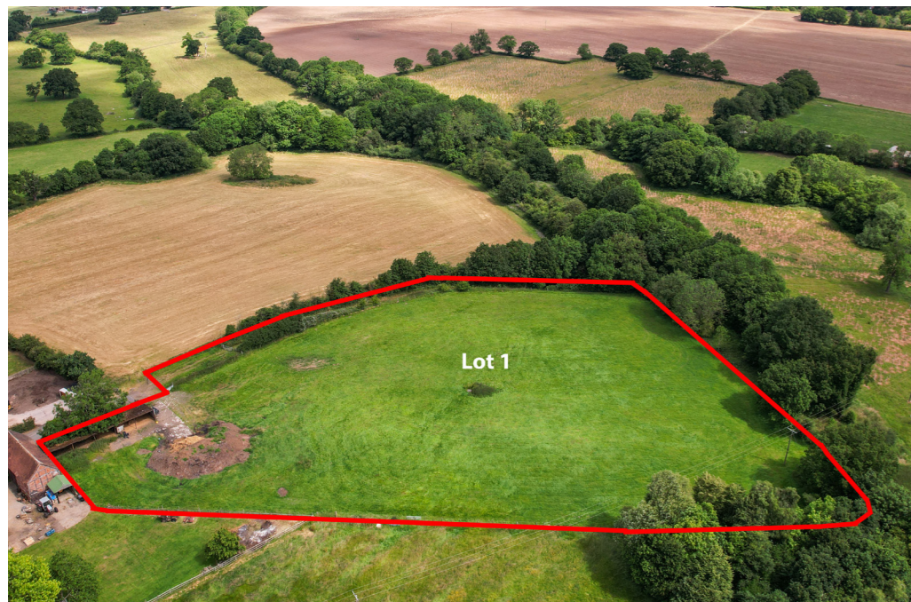
LOT 1 – (RED) Perrymill Paddock Land off Perrymill Lane 1.275 ha / 3.15 acres c/w Open fronted 5 bay barn (approx. 18m x 5m) & concrete pad Crop type – Permanent grass What3Words: ///moss.truth.reap

The land is split into 5 versatile blocks of productive agricultural land. Lot 1 is permanent pasture and has the benefit of a useful open fronted building. Lot 2 is currently pasture but has largely been in arable use in the past. Lot 3 is arable. Lot 4 is part temporary grass/ part permanent/ part woodland. Lot 5 is arable.