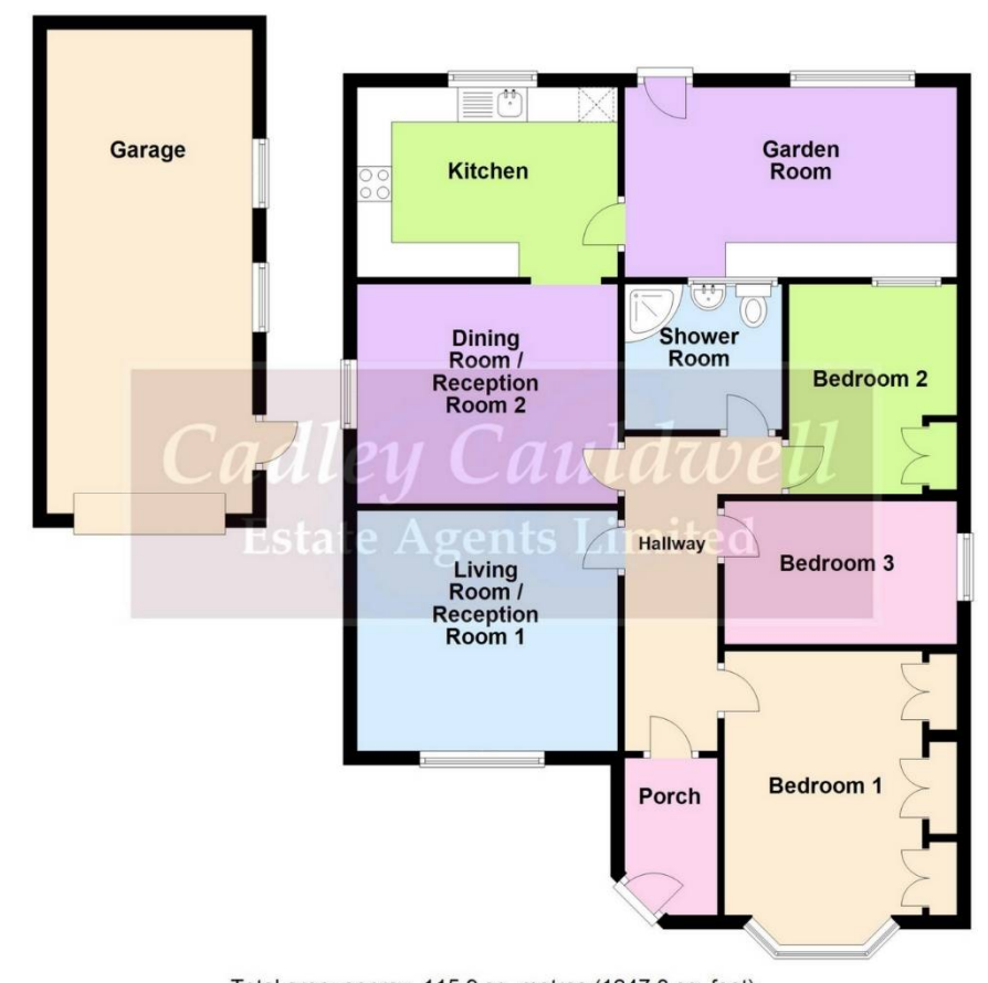
Total area: approx. 115.9 sq. metres (1247.8 sq. feet)

Please note - these are not to scale.For display purposes only Plan produced using PlanUp.