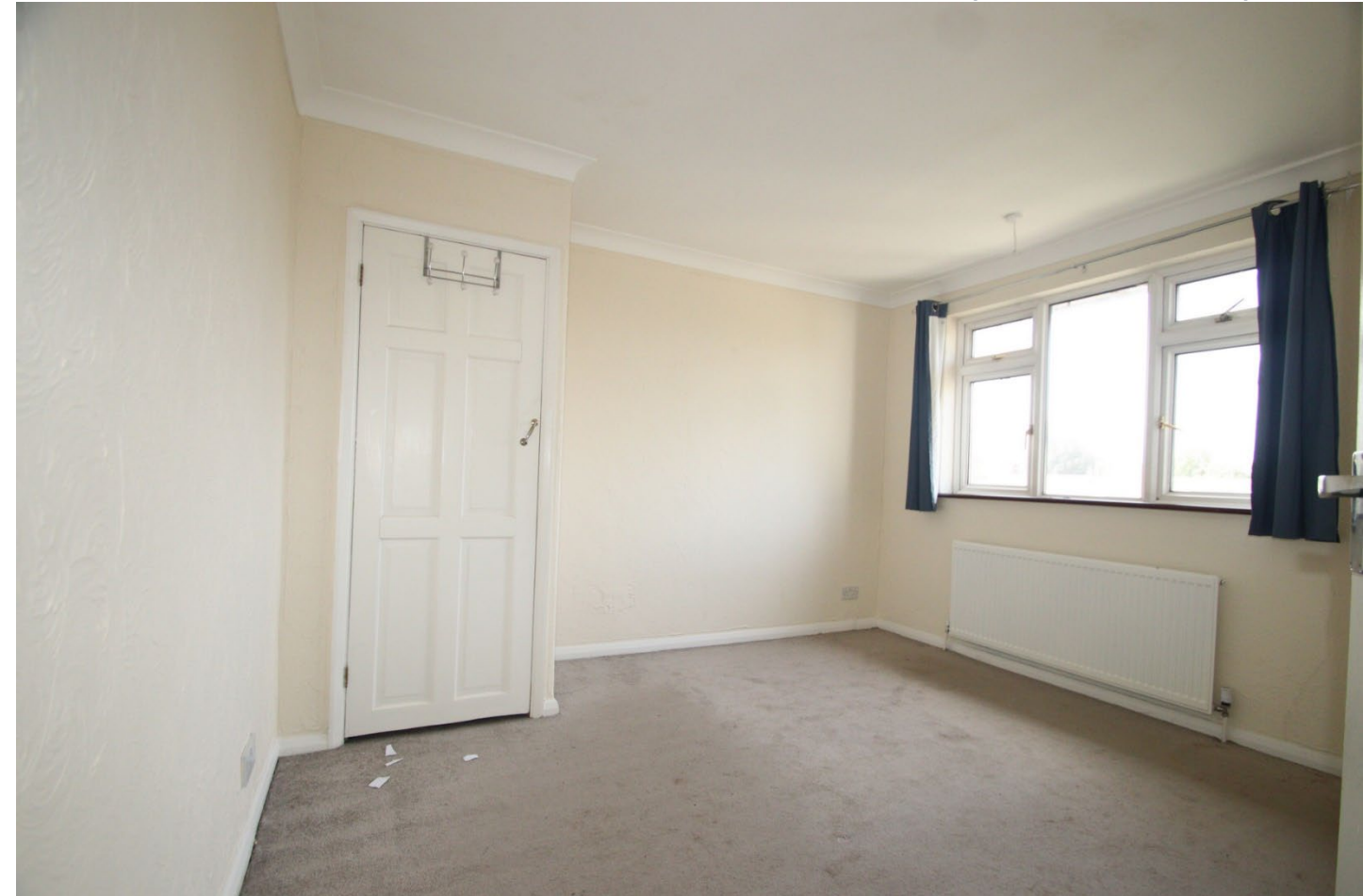
Guide Price £400,000 - £425,000

******GUIDE PRICE OF £400,000 to £425,000****** CASH BUYERS PREFERRED******The property is Laing Easi-Form construction. This semi-detached home is located in a popular location and is offered in good general condition. The house has been extended to the ground floor to provide fantastic accommodation for a growing family. The ground floor offers a huge lounge, a spacious open plan kitchen/dining room, a utility room, a further room that can either be used as storage or indeed a study. Off the porch entrance there is also a guest cloakroom and to the side of the property the extension provides 2 excellent sized bedrooms and a 3-piece bathroom. The first floor is equally impressive with 3 bedrooms and a full bathroom. The rear garden is very secluded and is a perfect size for a family. To the front of the property there is ample off-street parking for several vehicles. The property is double glazed and centrally heated and is offered with NO FORWARD CHAIN. This is a very competitively priced for the accommodation of offer.