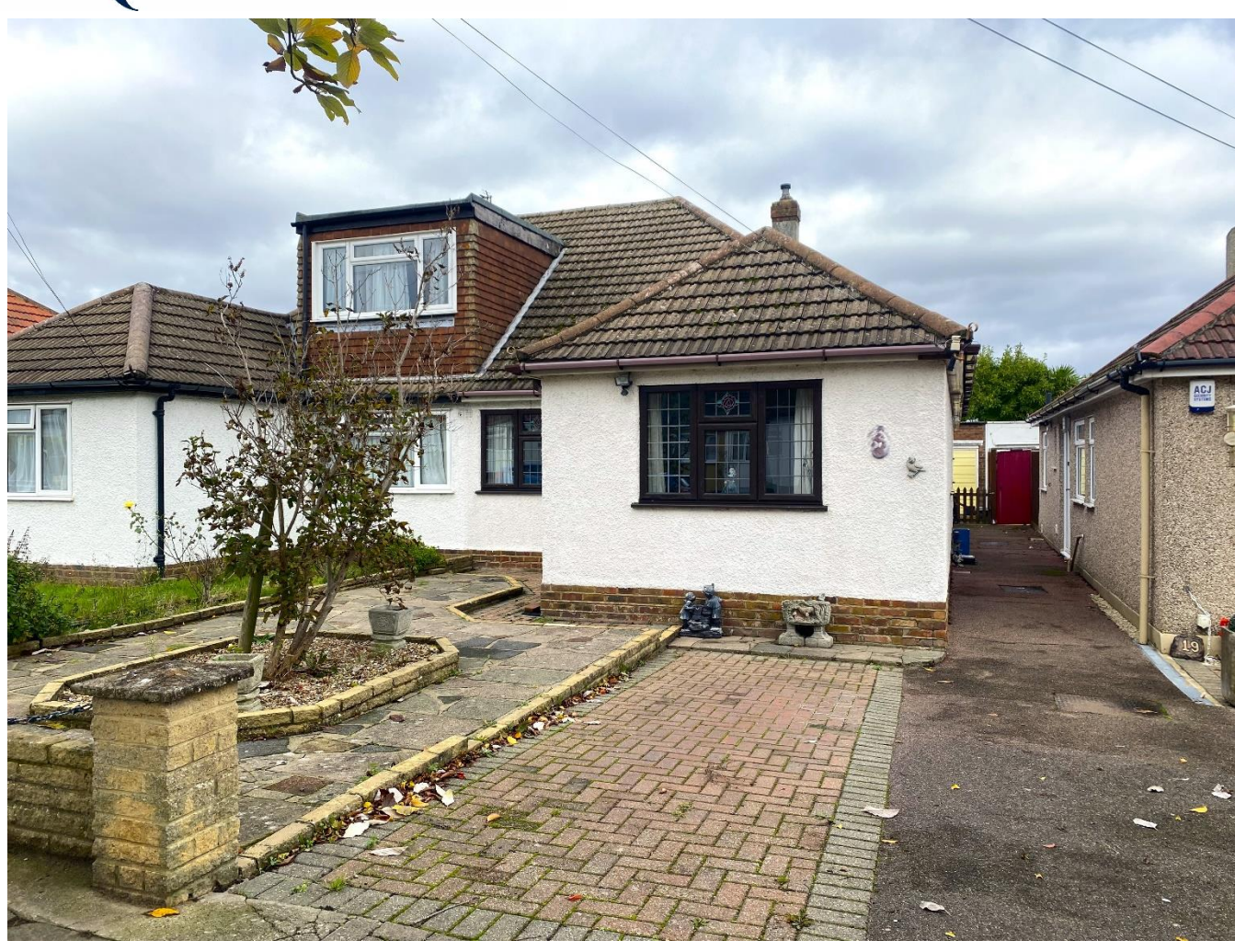
Renton Drive | Orpington | BR5