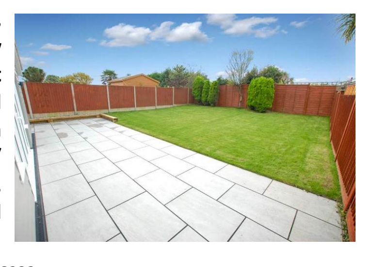
£450,000 Freehold NO ONWARD CHAIN

www.lawrenceandco.co.uk Tel: 01303 266022 email: findahome@lawrenceandco.co.uk