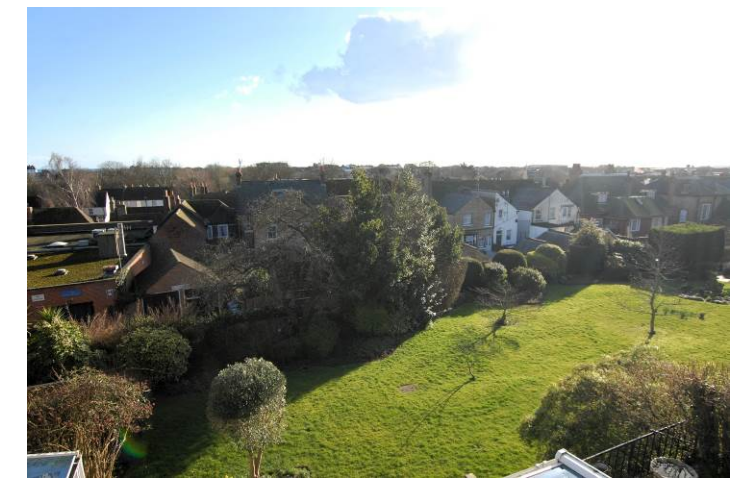
£400,000 Freehold NO ONWARD CHAIN

www.lawrenceandco.co.uk Tel: 01303 266022 email: findahome@lawrenceandco.co.uk