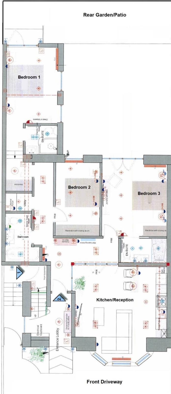
Brondesbury Road London NW6 6BS Approx. GIA: 947 Sq Ft (88 Sq M)