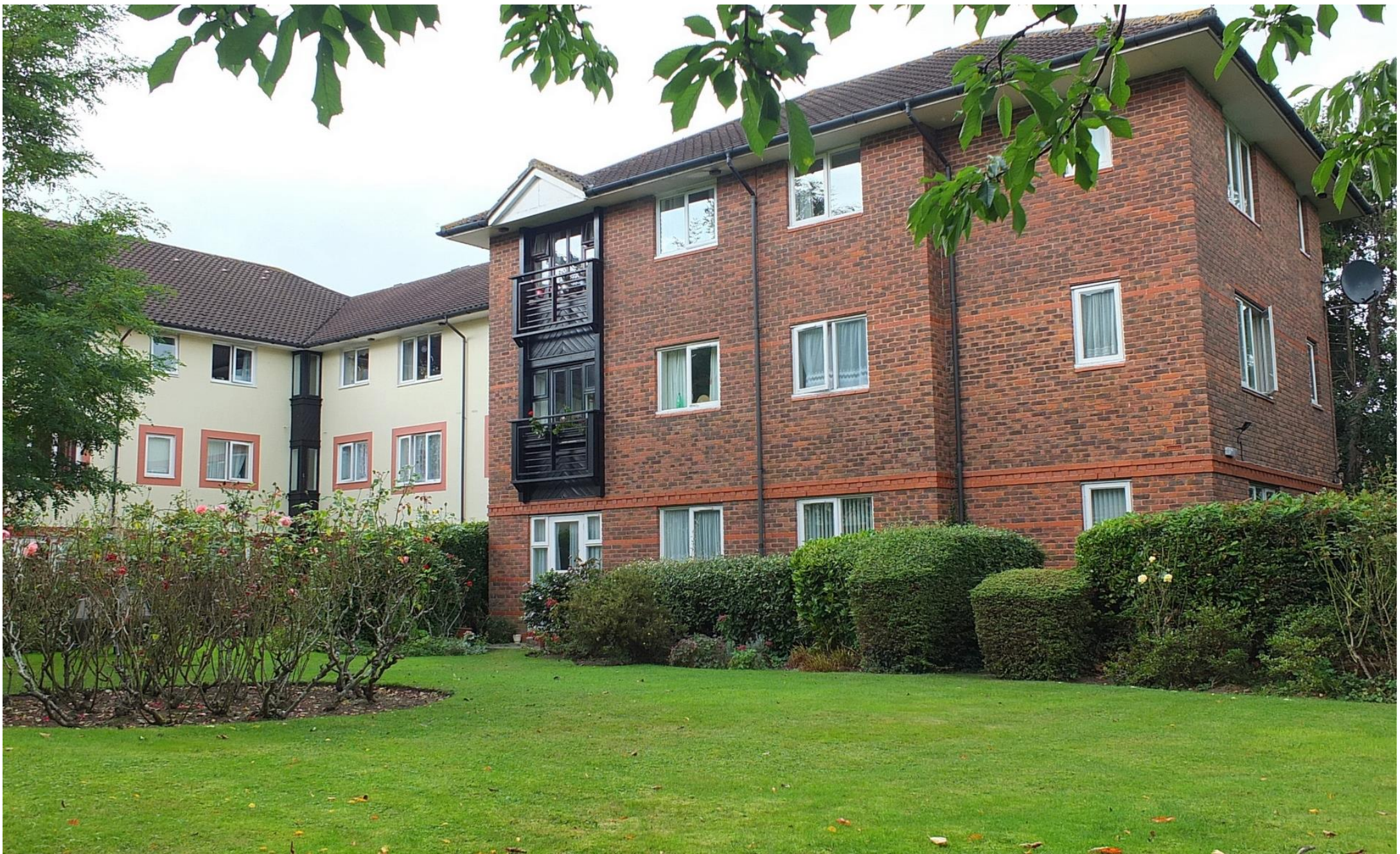
29 Clover Court Church Road, Haywards Heath, RH16 3UF