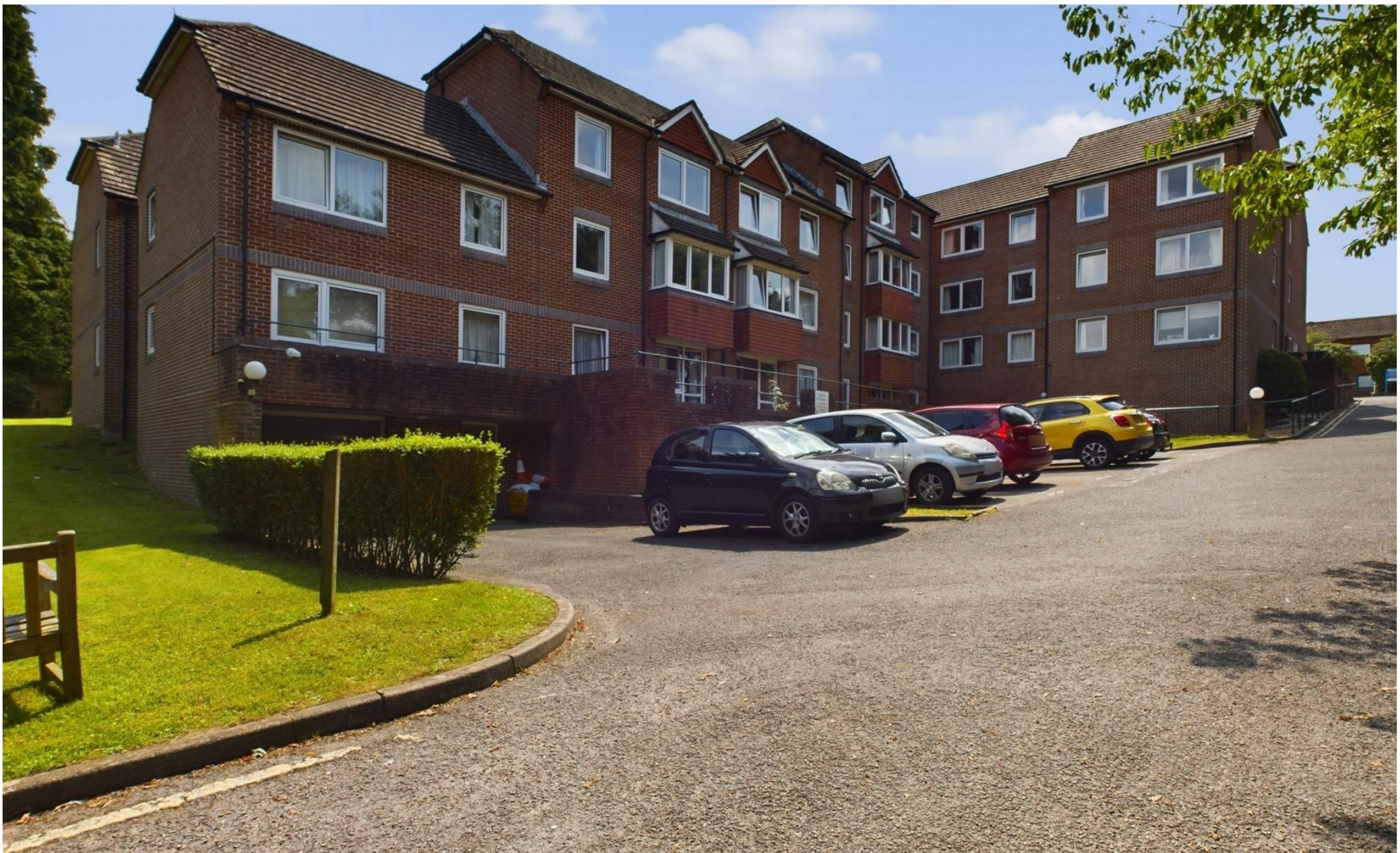
45 Heath Court Heath Road, Haywards Heath, RH16 3AF