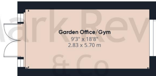
Ground Floor Building 2