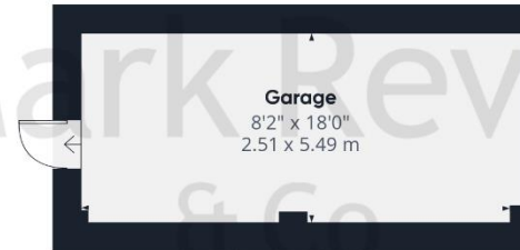
Ground Floor Building 3