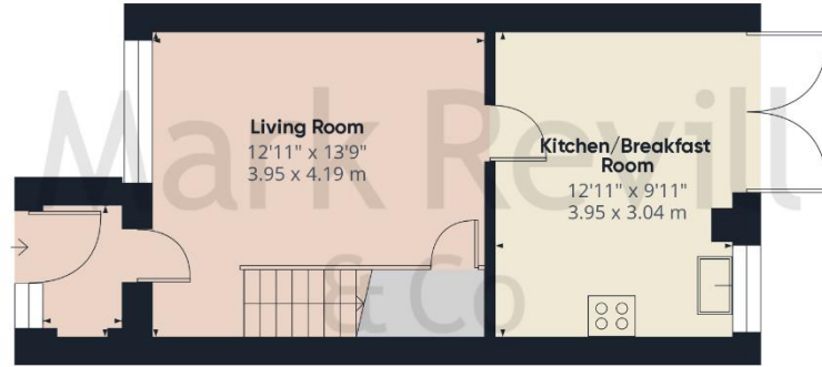
Ground Floor Building 1