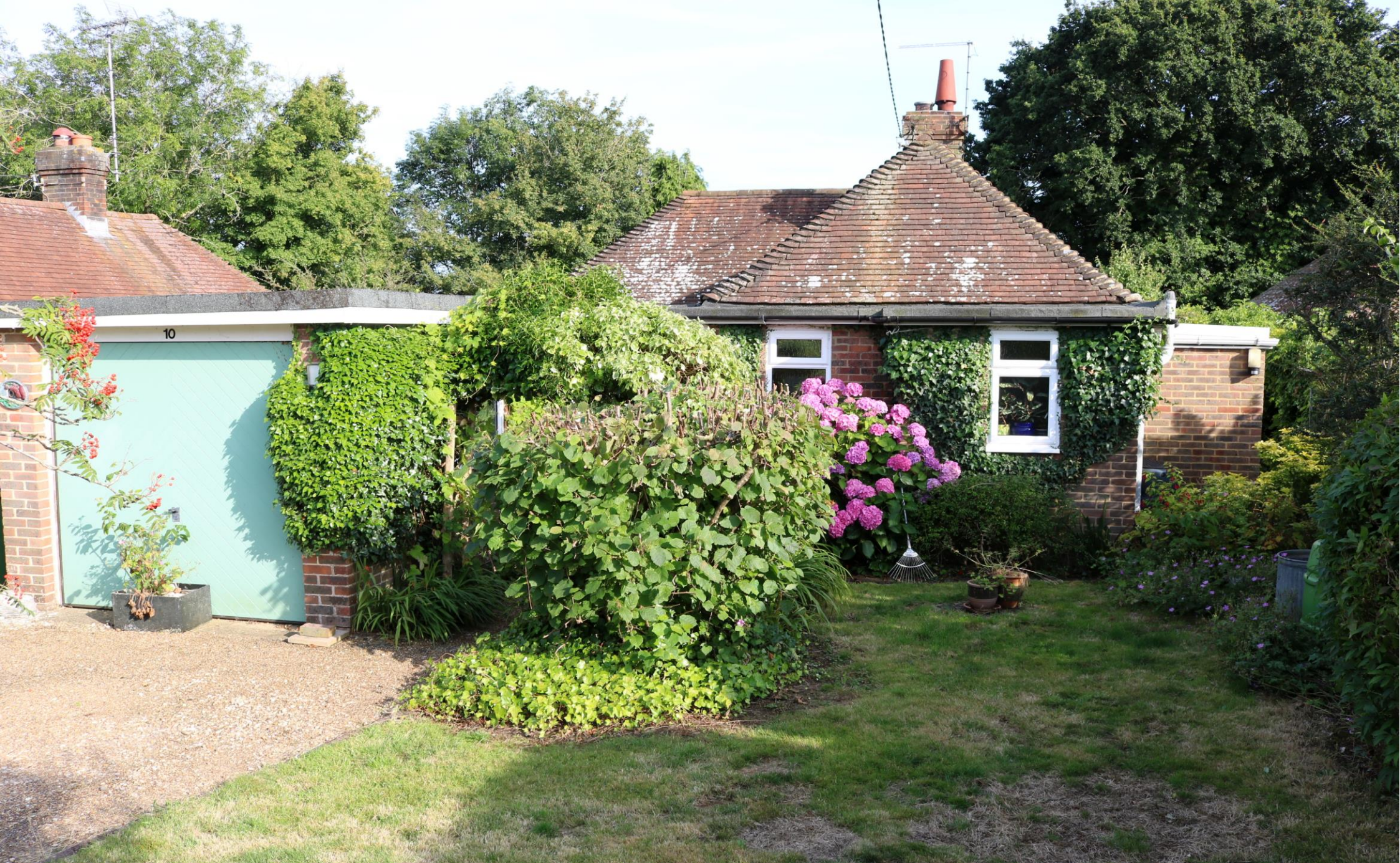
10 Barnfield Plumpton Green, East Sussex. BN7 3ED