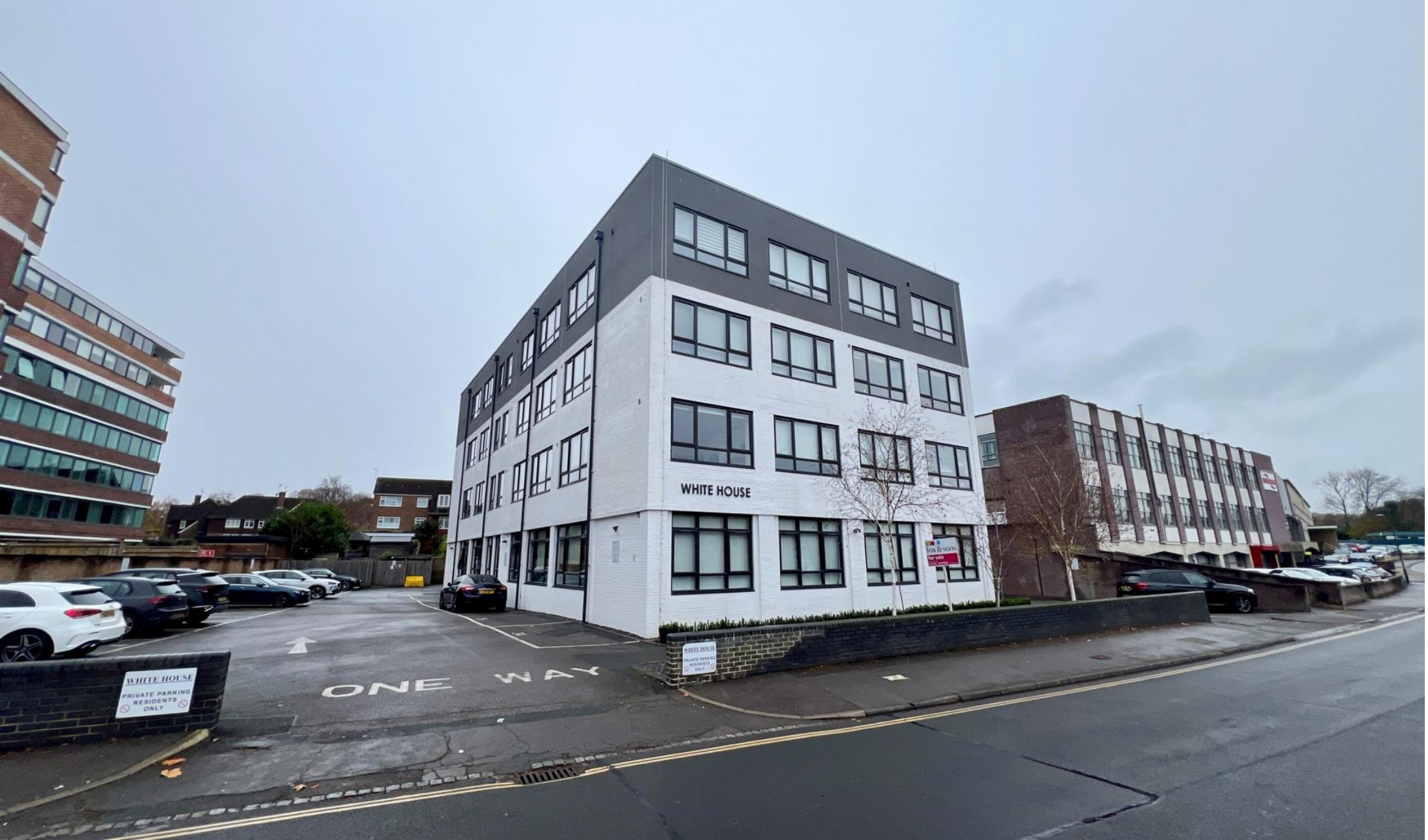
12 White House Burrell Road, Haywards Heath, RH16 1AJ