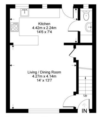
Ground Floor = 35 sqm / 377 sqft