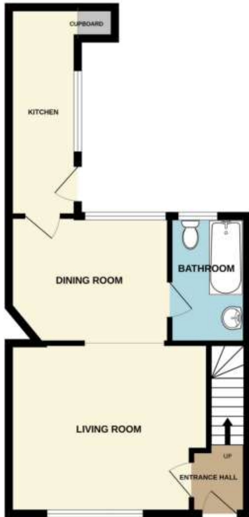
GROUND FLOOR 448 sq.ft. (41.6 sq.m.) approx.