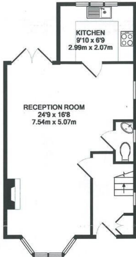
GROUND FLOOR APPROX. FLOOR AREA 462 SQ.FT. (42.9 SQ.M.)