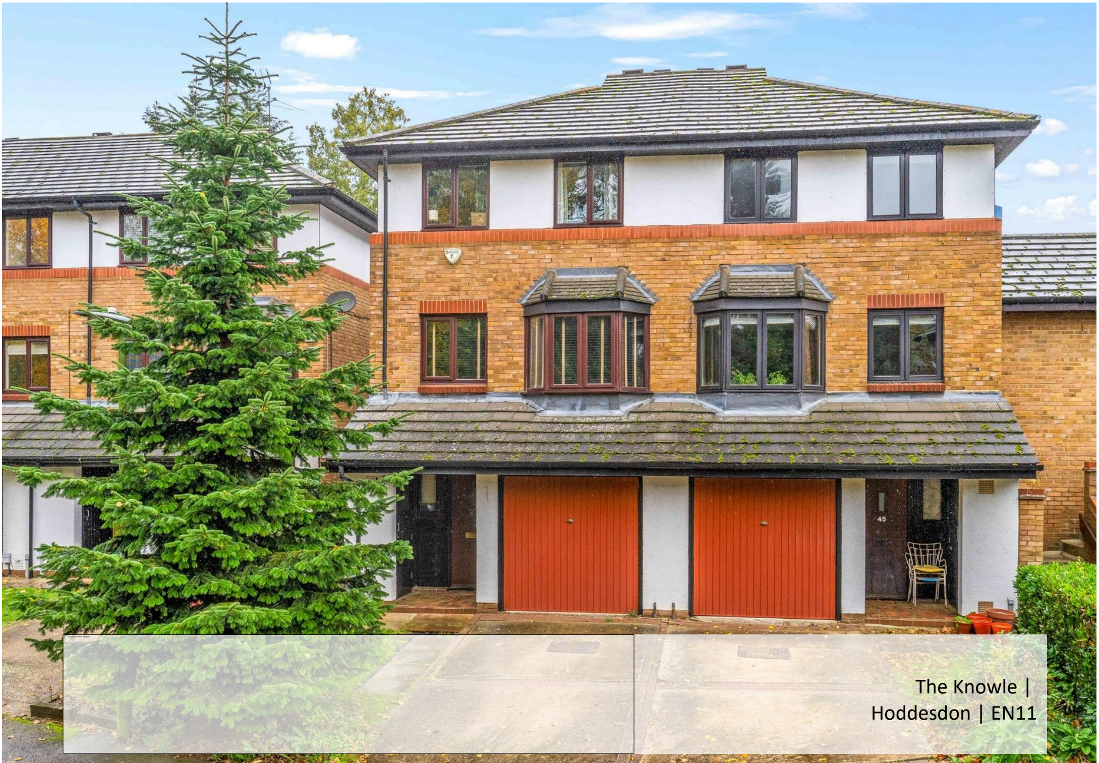
The Knowle | Hoddesdon | EN11